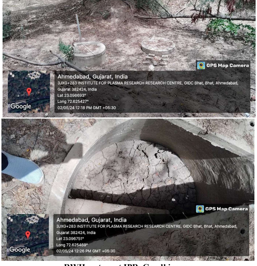
RWH system at IPR, Gandhinagar