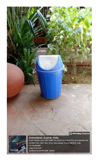
Dustbins are placed at many places at IPR