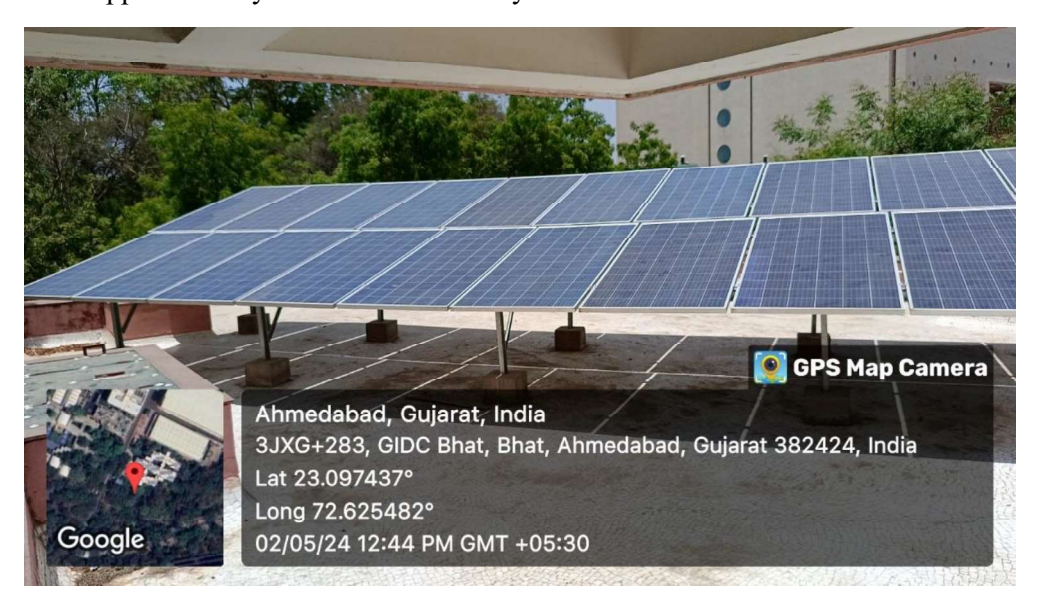
Solar Panel Installed on the roof of various buildings of IPR

During the last 1-year IPR has achieved 100 kW of renewable Energy through solar power. This has reduced the electric consumption through the power grid by 100 kW thus having a net saving of Rs. 2.50 Lakhs approximately in the last financial year.