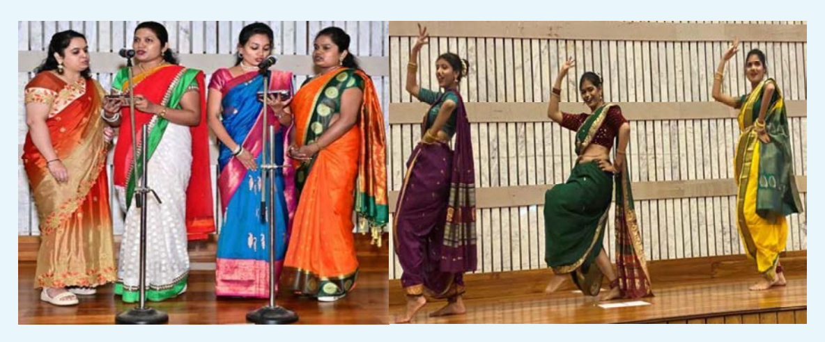
Cultural program being presented by HBNI staff and students on International Women's Day celebration at HBNI