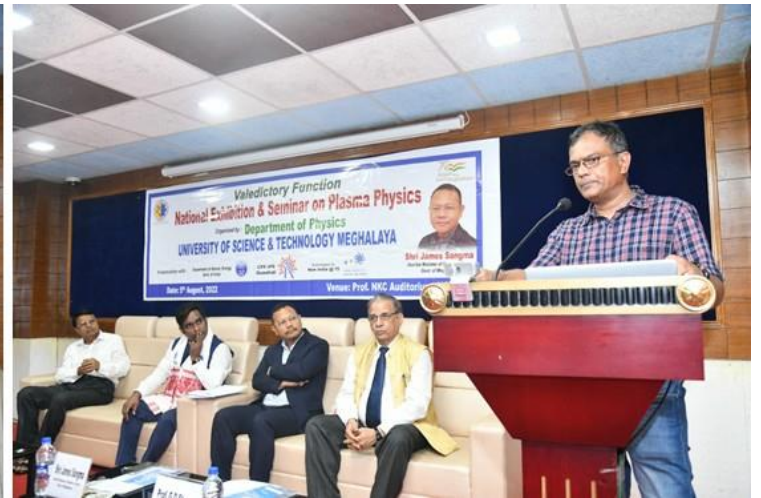
The Honorable Health & Forest Minister of Meghalaya, Shri. James K. P. Sangma during the concluding session and his visit to the IPR Plasma exhibition