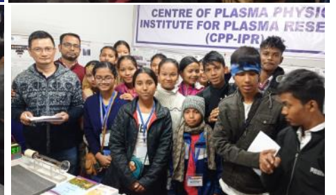
Images from the CPP-IPR participation in the Assam State Science Fair -2022