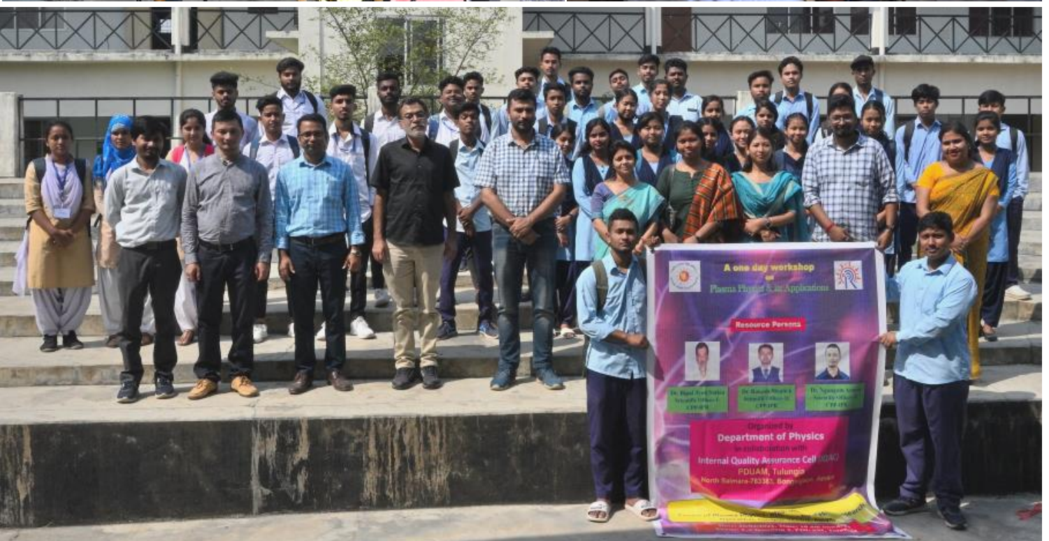
Images from the one-day workshop on plasma conducted by CPP-IPR at Bongaigaon (Assam)