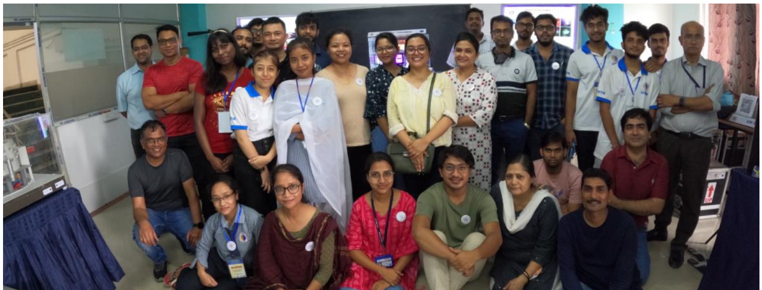
PhD scholars of CPP-IPR and student volunteers of USTM with IPR Team at the Plasma Exhibition at USTM.