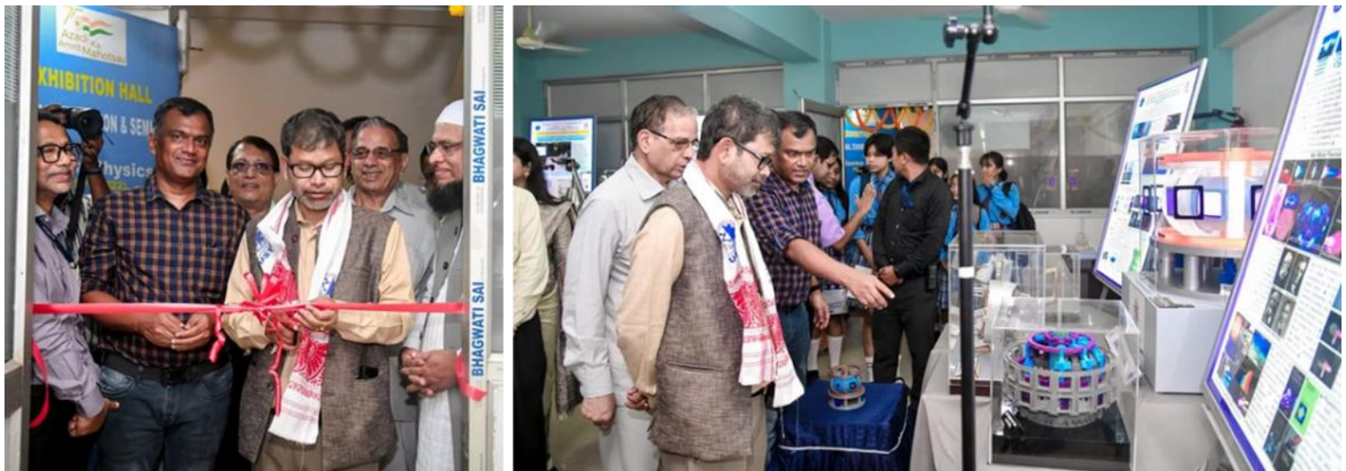
(L) The inauguration of the plasma exhibition by Shri. Lakhmen Rymbui, Hon’ble Education Minister, Meghalaya