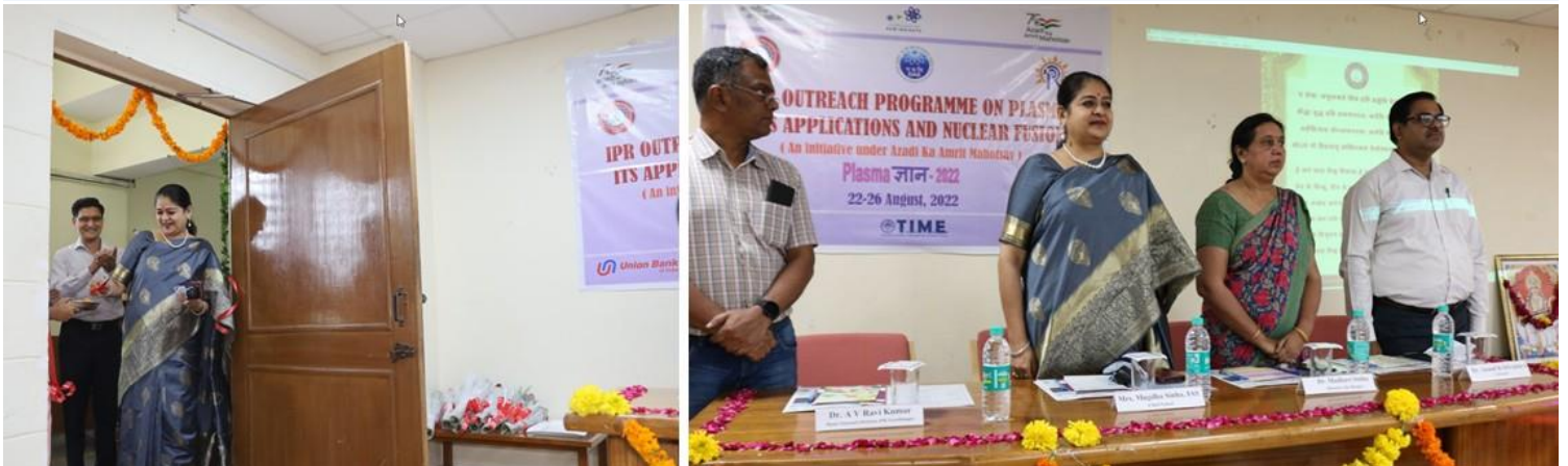
Inauguration of the event