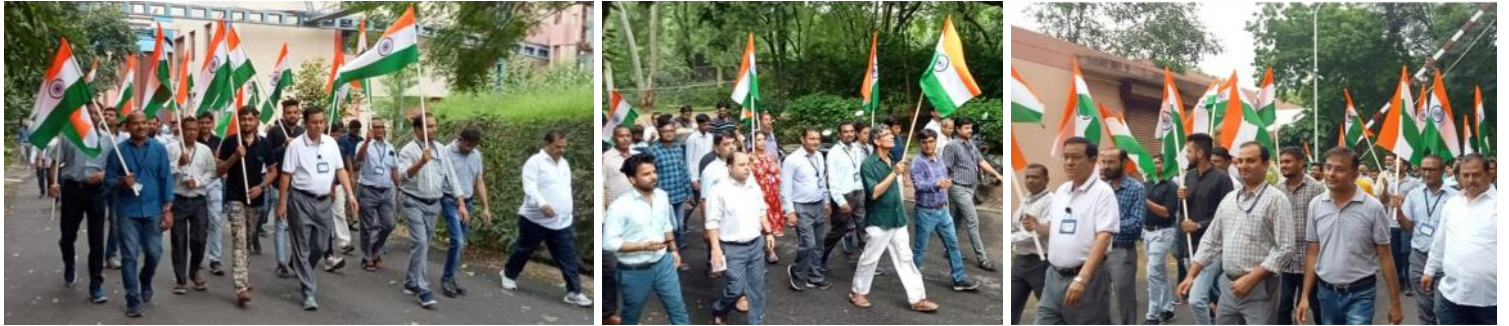
Images from the "Tiranga Yatra" organized at IPR on 10th August, 2022