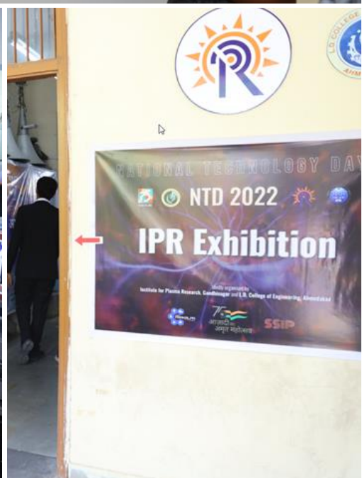
Images from the NTD-2022 event