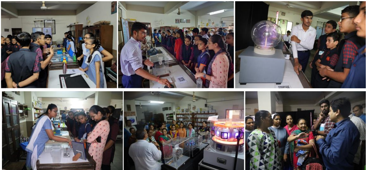
The plasma exhibition