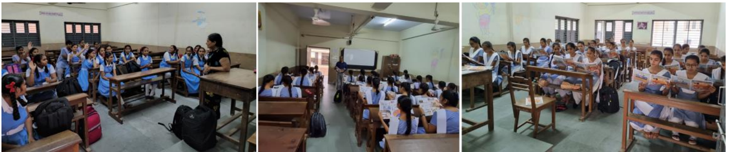
Introducing plasma to students