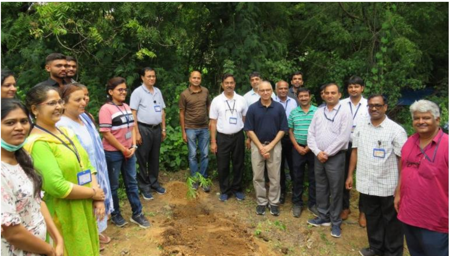
Tree planting campaign at IPR campus during the AKAM Iconic week