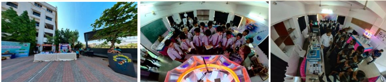
360 images of the event (click on image to view)

The 4-day event consisted of a popular talk on plasma and its applications and exhibition of over 15 working models related to plasma and its applications. Over 1000 students of the host school as well as students from nearby schools in this taluka visited the exhibition. As part of the event, the Gujarati version of the children's comic book on plasma " The Wonderful World of Plasma " was also distributed to all the participating students and teachers. A set of 10 posters on plasma and a popular book on plasma "Living with Plasma" were also distributed to the visiting schools for display in their school's library. IPR Outreach proposes to conduct such events in rural schools of Bhuj and Banaskantha districts in the coming months. Click here for detailed report.