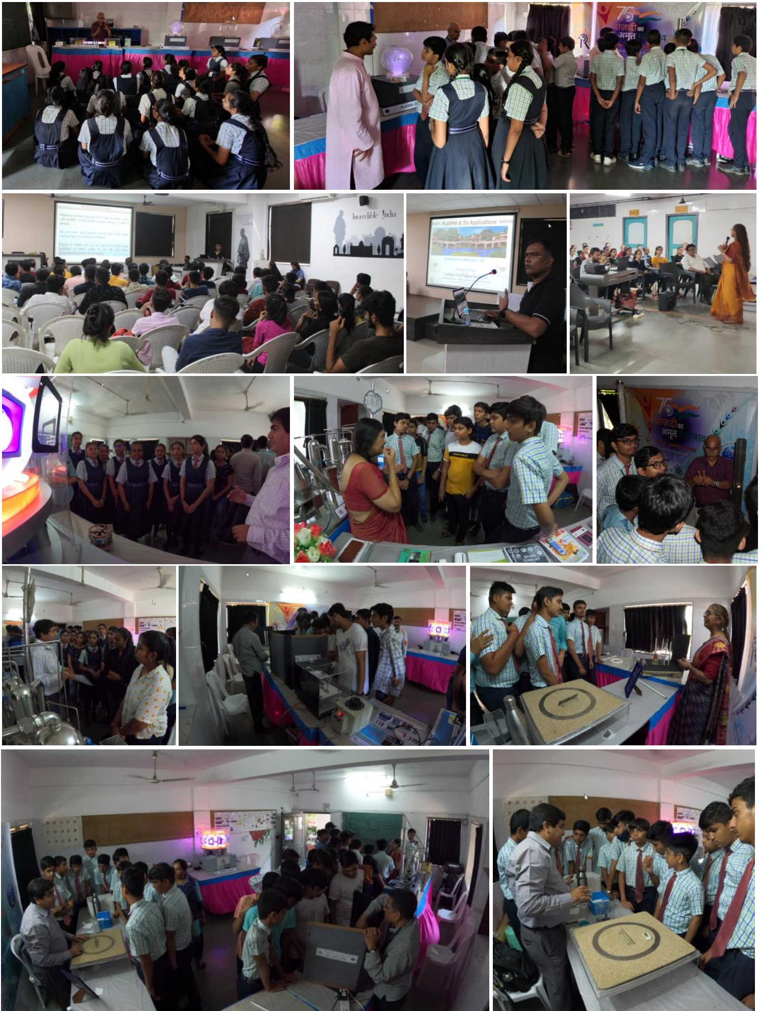
Images from the event