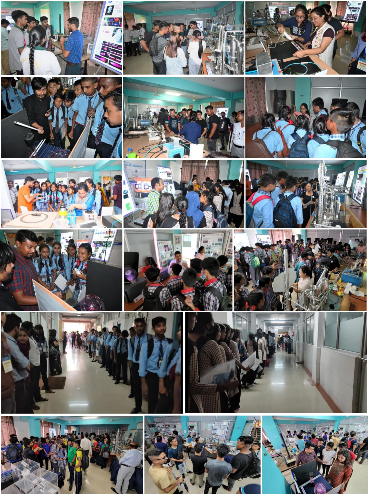
Images from the Plasma Exhibition at USTM