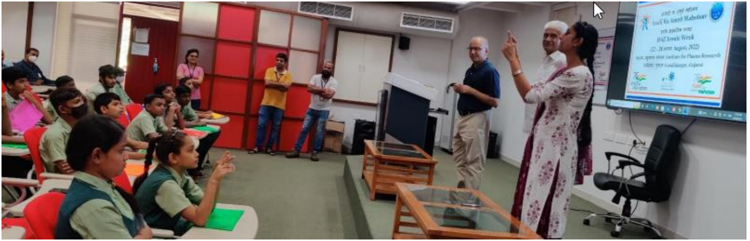
Director IPR interacting with the deaf & mute students