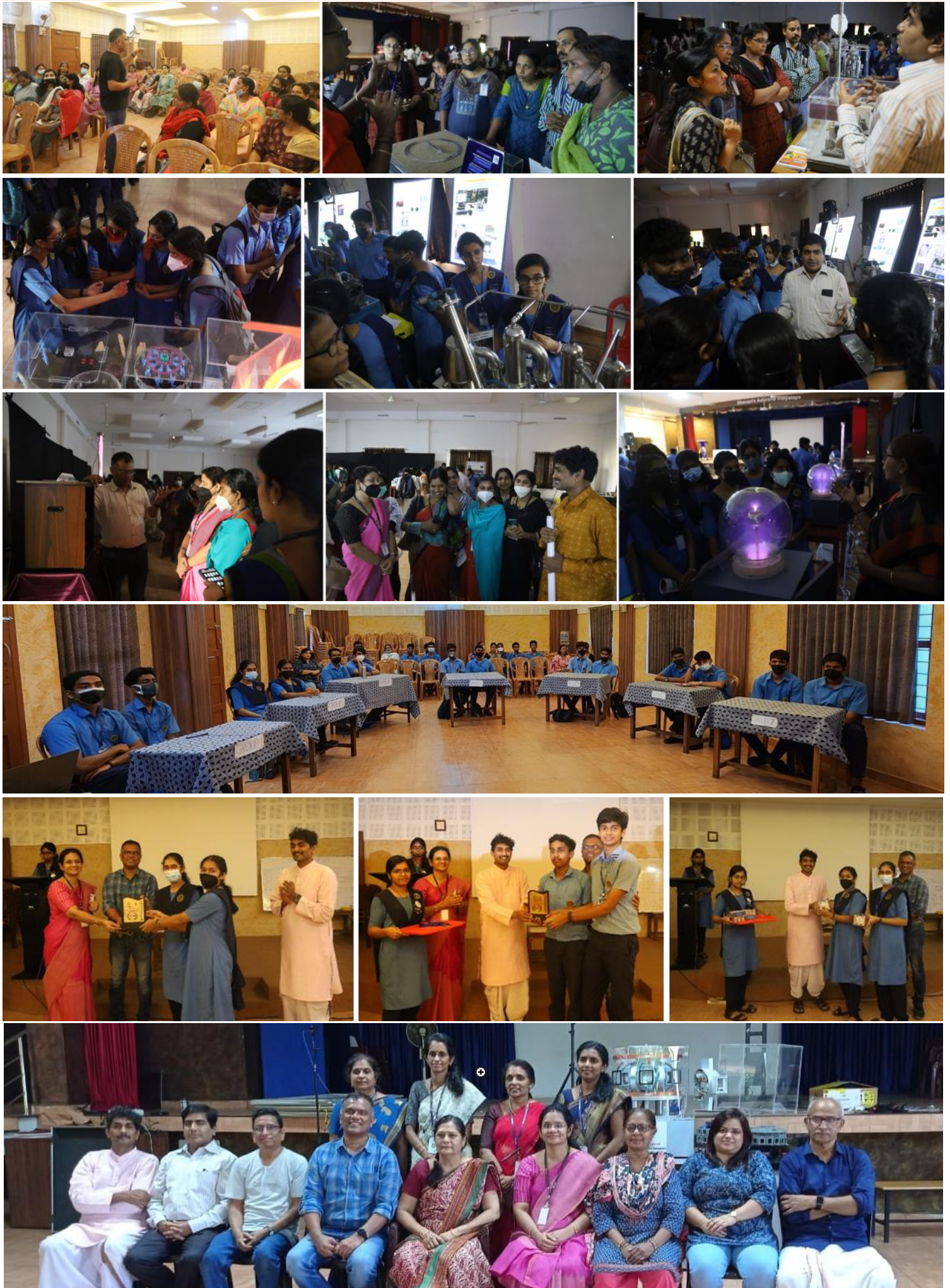
Images from the scientific outreach programme conducted at Kochi, Kerala