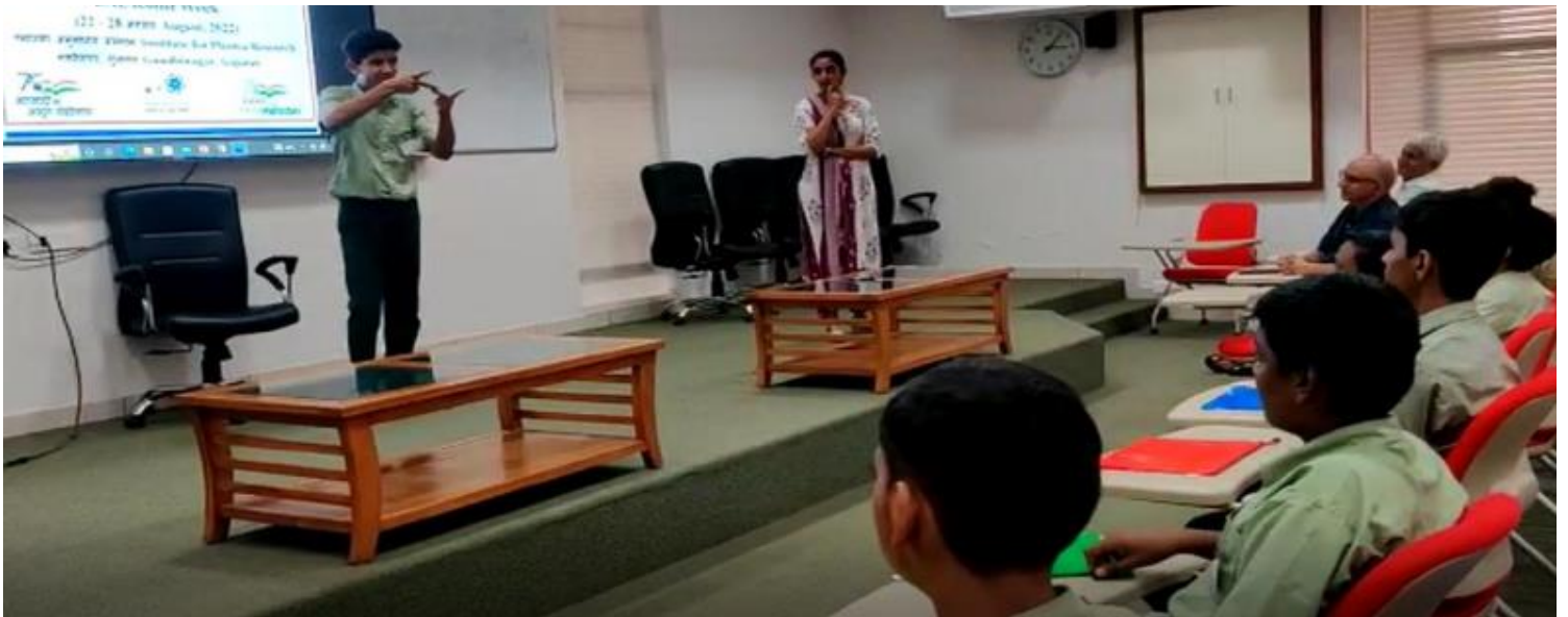
Deaf & mute student giving his feedback of the visit to IPR