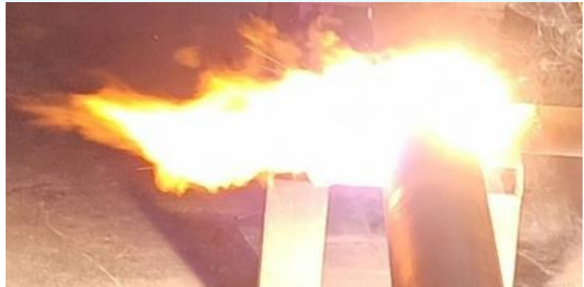
(L) The plasma arc as seen through the viewport (R) Plasma arc using graphite electrodes