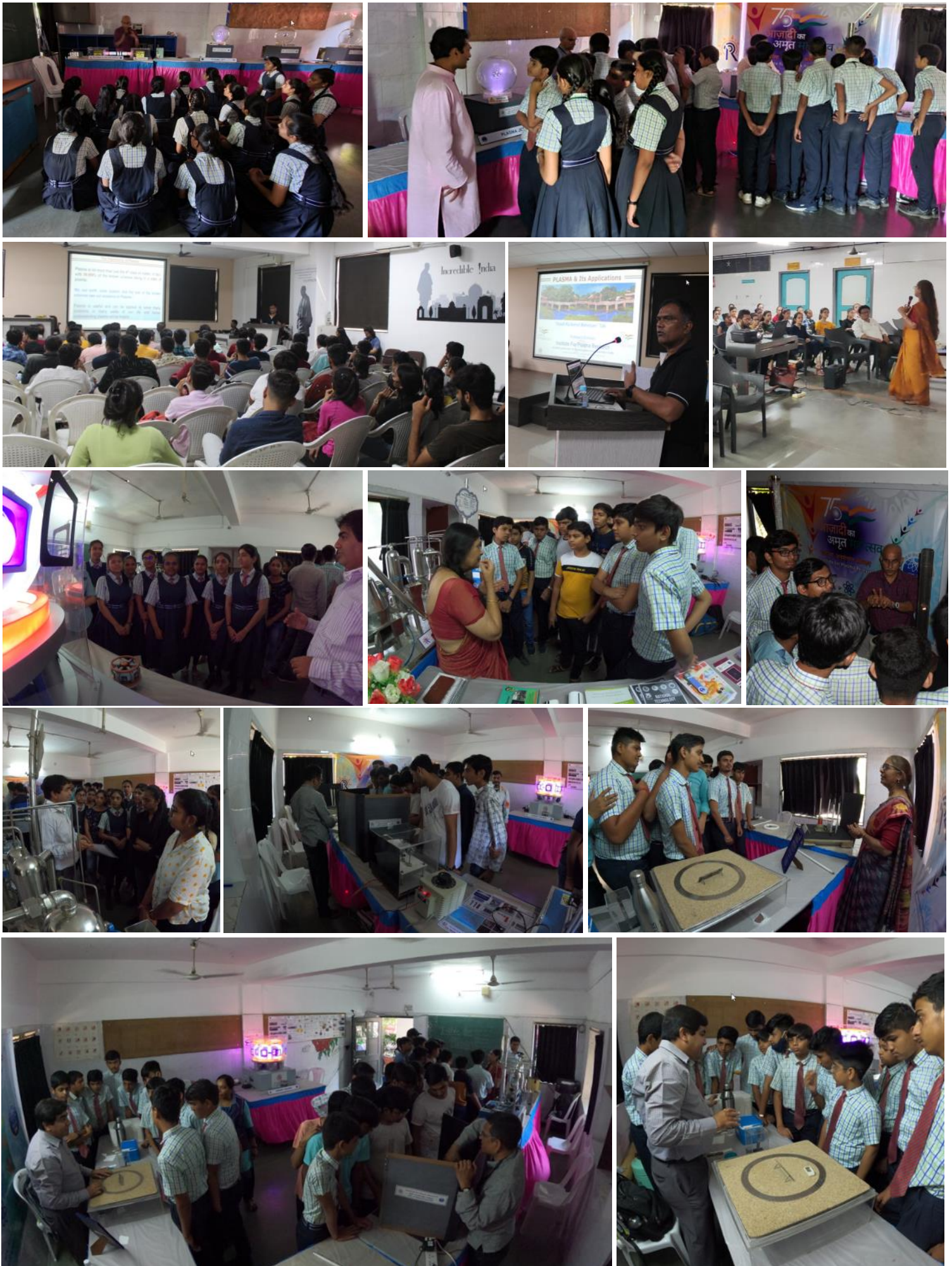
Images from the event