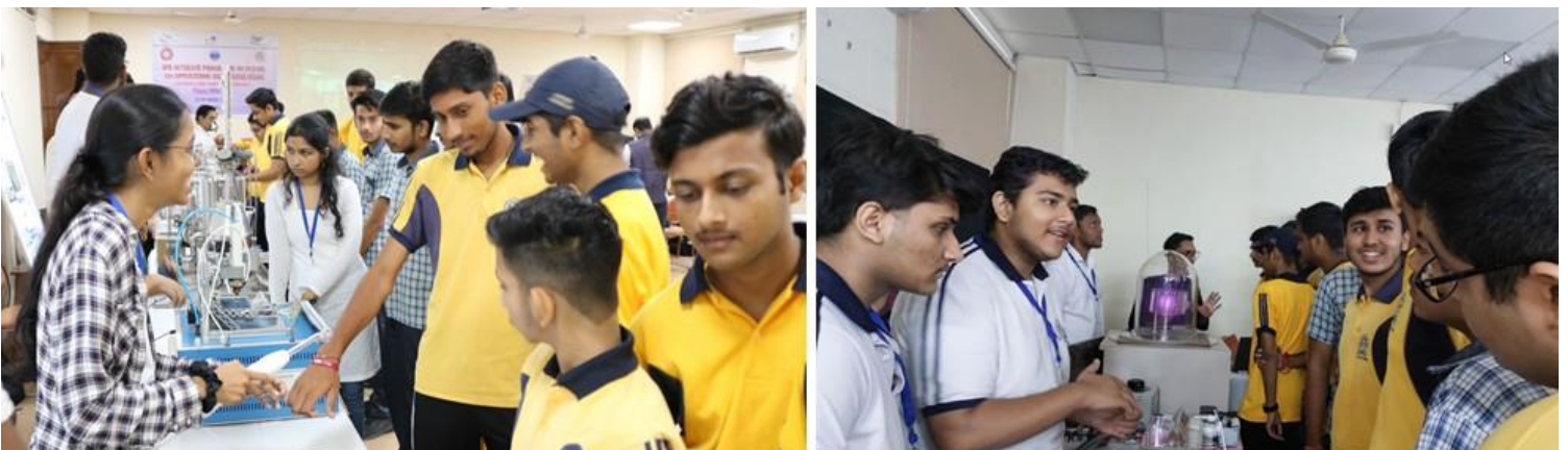
The plasma exhibition