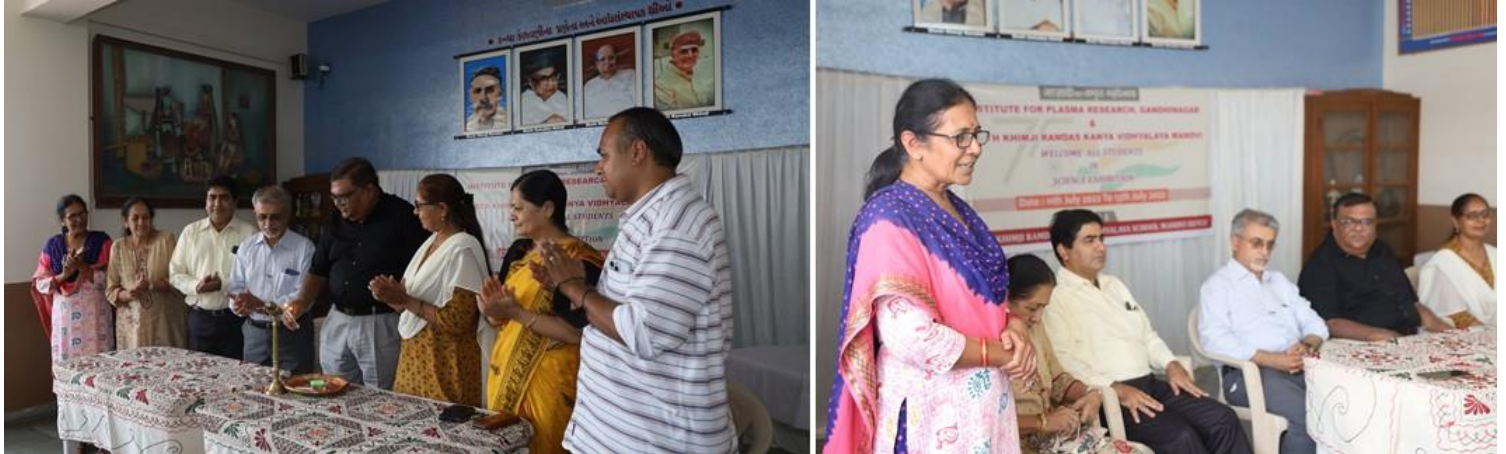
Inauguration of the event

As part of the event, the Gujarati version of the children's comic book on plasma "The Wonderful World of Plasma" was also distributed to all the visiting students and teachers. Students from the school were trained to explain the exhibits to visitors. A set of 10 posters on plasma and a popular book on plasma "Living with Plasma" were also distributed to the visiting schools for display in their school's library. IPR Outreach proposes to conduct such events in rural schools of Bhavnagar and Porbandar Districts of Gujarat in the coming months. For more details click HERE .