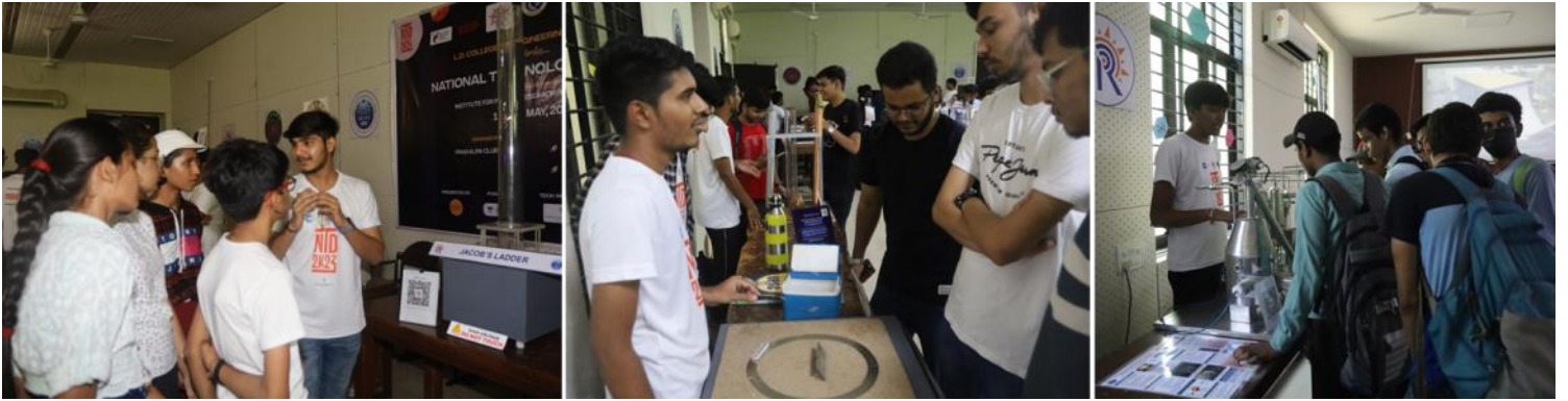
Student volunteers from LDCE explaining the IPR exhibits to visitors