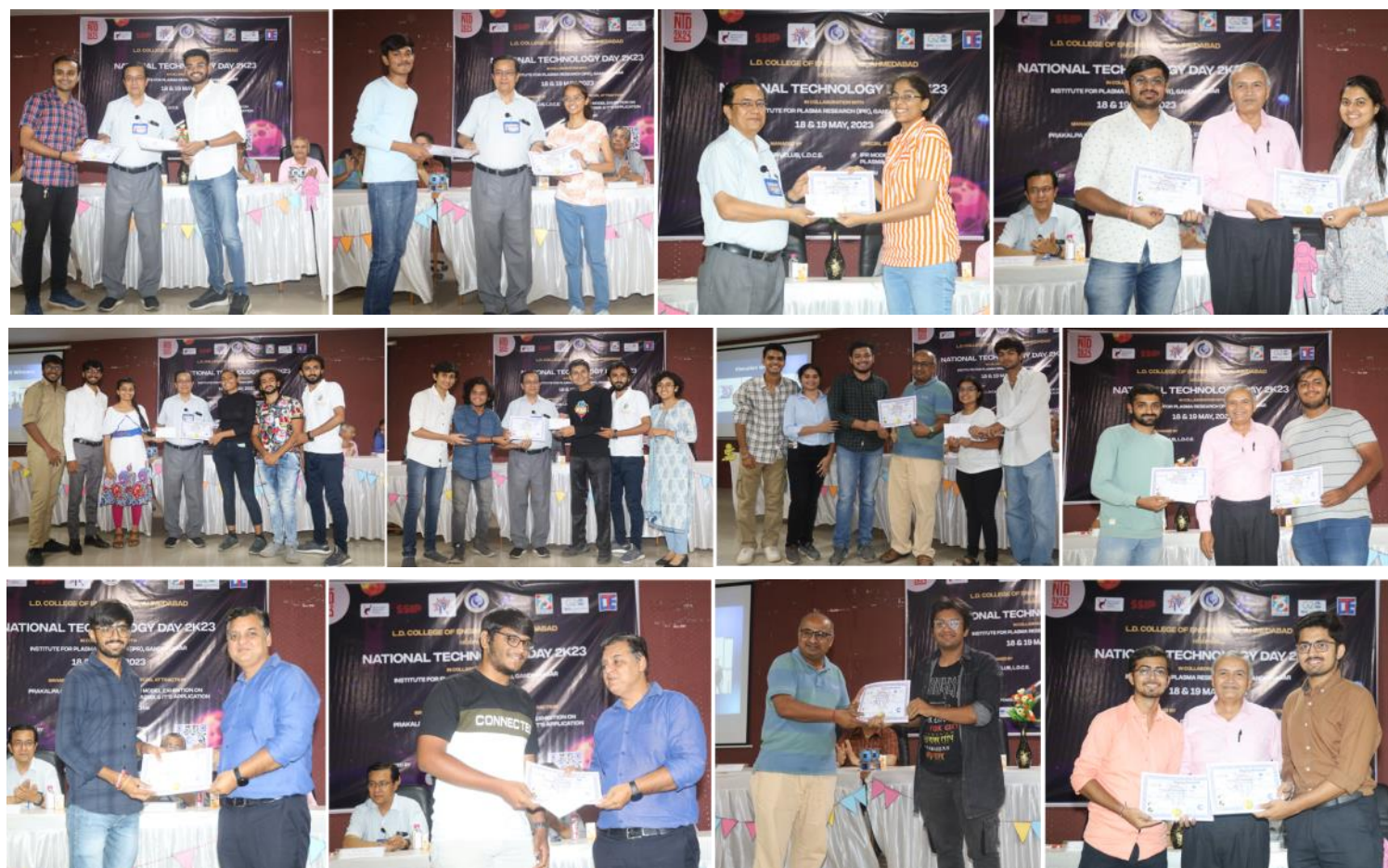
Prize distribution of NTD-2023