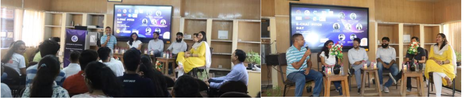
(L) "B-Chai Pitch" interaction of students with start-up entrepreneurs