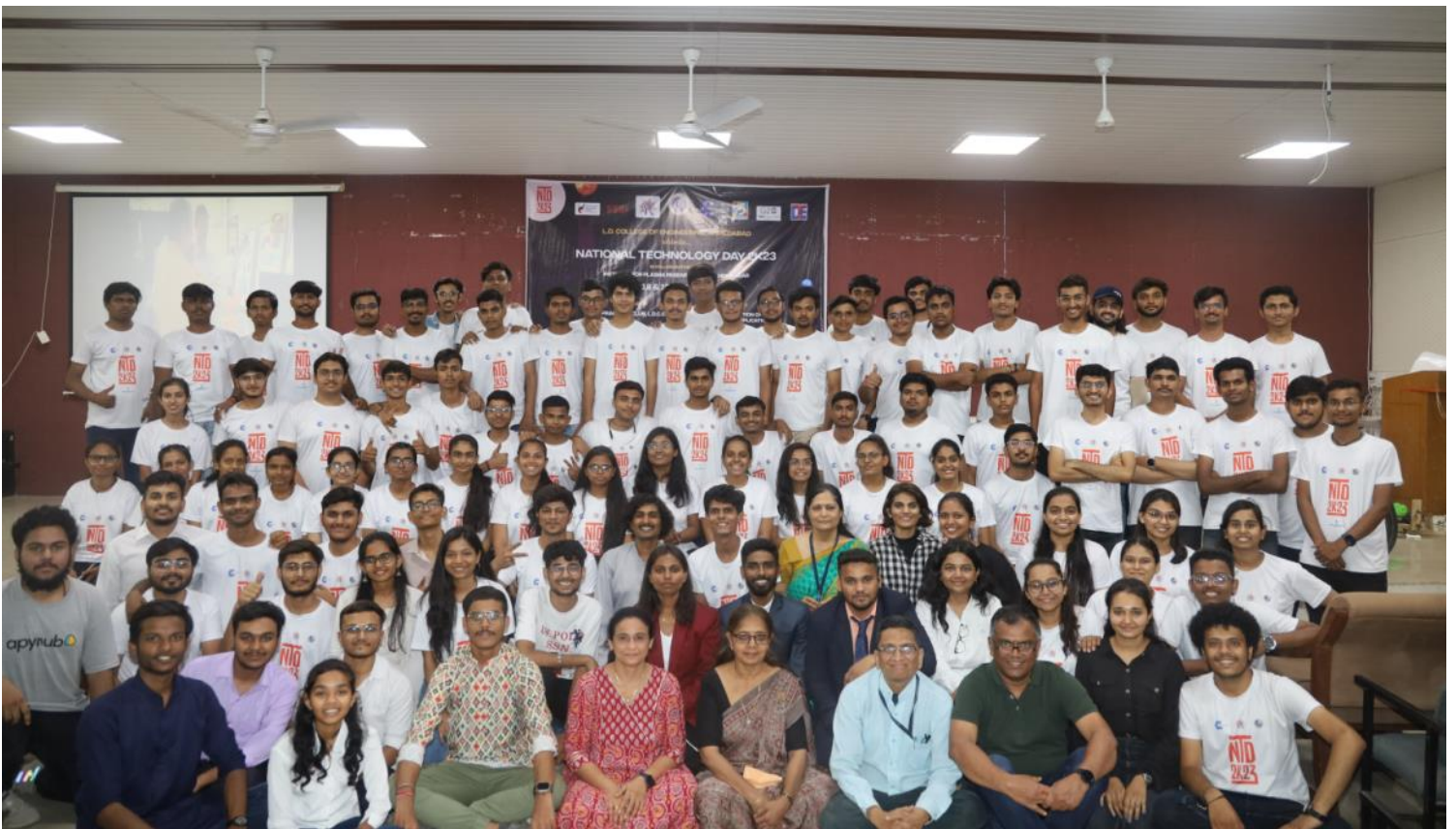
IPR ORD members with the NTD 2023 organizing team from LDCE