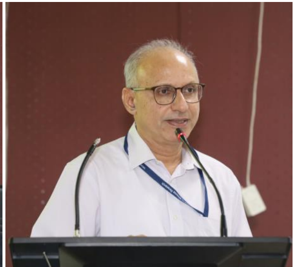
Director, IPR lighting the lamp and addressing the gathering during inauguration of the event