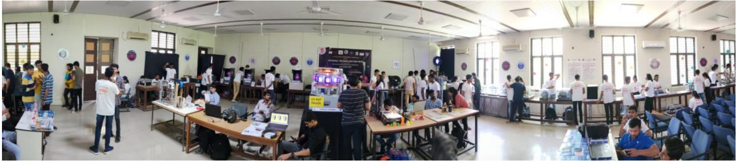
View of the exhibition of Plasma as well as the technical models by engineering students.