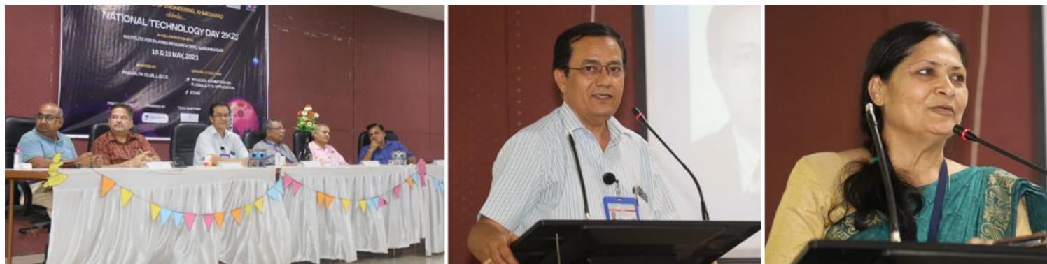
Concluding session of NTD-2023