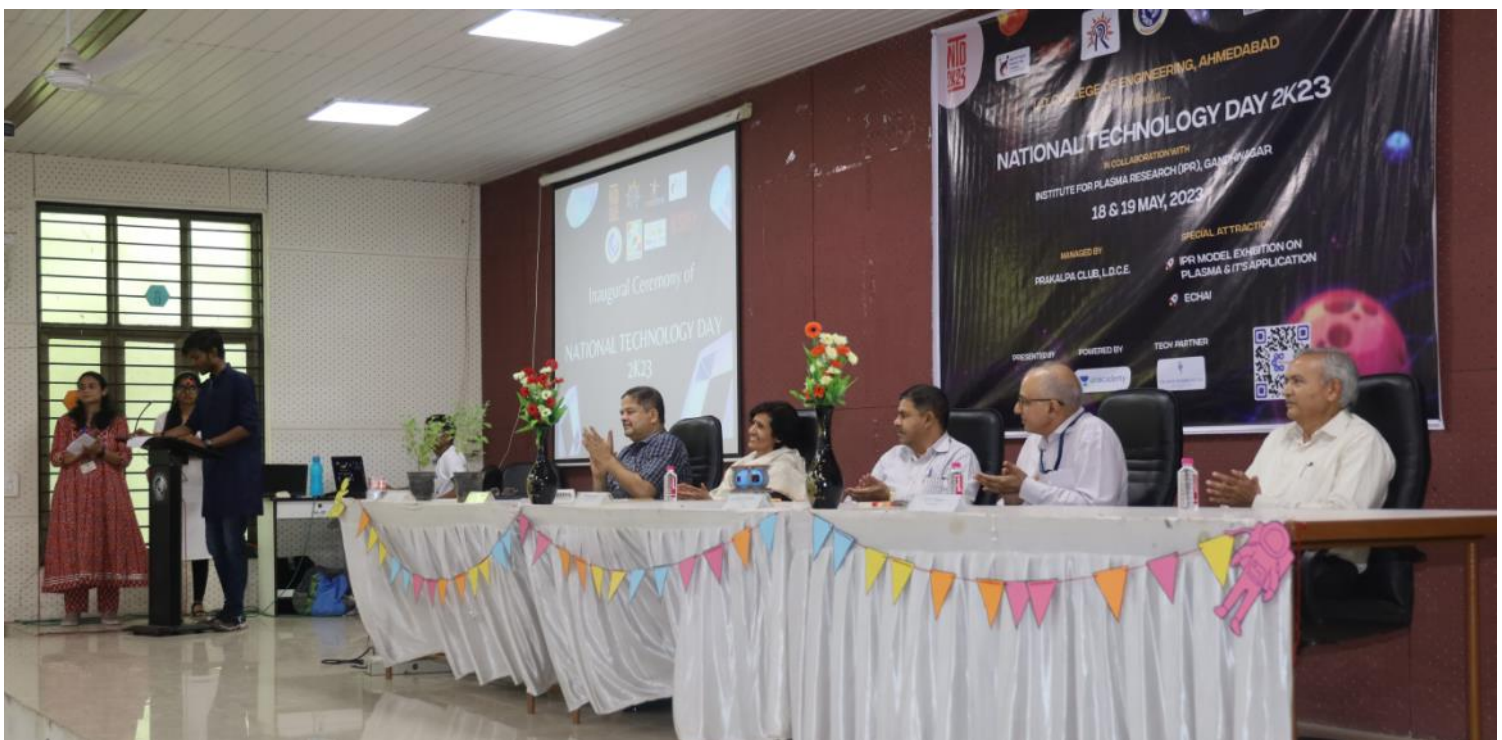
The inauguration of NTD-2023 in progress