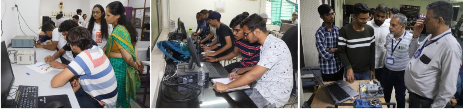
(L) Circuit debugging (M) Code debugging (R) Technical exhibits of students in progress