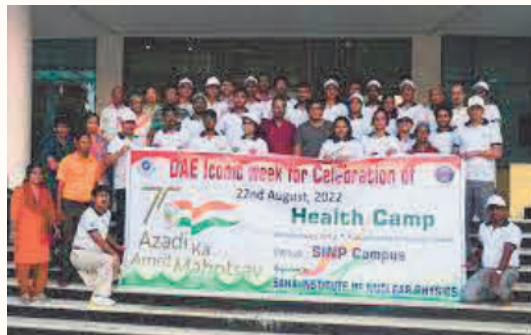
Online lecture in progress at HRI (left); Health camp organized at SINP (right)