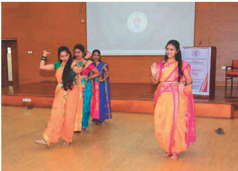
Cultural program presented by HBNI students and staff members on the occasion of International Women's Day celebration at HBNI