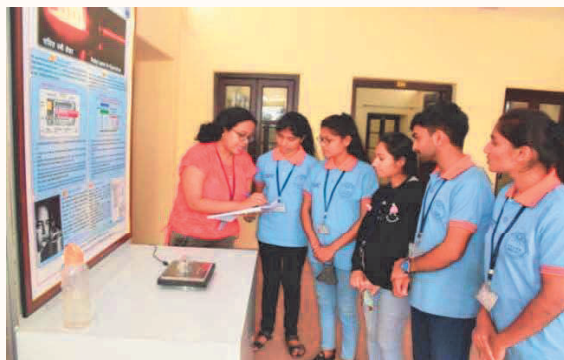
Sand sculpture illustrating the contribution of the nuclear power created on the beaches of IGCAR (left); Visit of students to the Light Exploratorium at RRCAT (right)