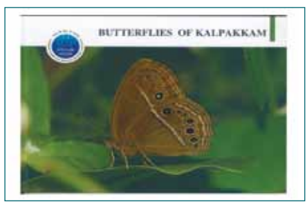
Fig. 1: Butterflies of Kalpakkam

Preprints server, Auditorium facility, interlibrary loans, archiving IGCAR publications, news clips on FBRs, digitizing old print copy standards, content creation activities are other value added services from SIRD.