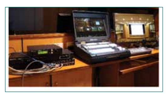
Fig. 2: Video streaming Facility