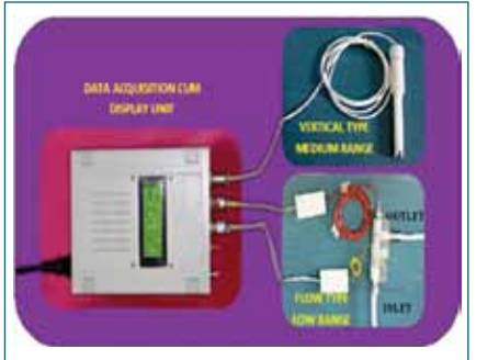
Fig. 1: Conductivity meter

IC-IGCAR will continue to play a role of providing the start-ups with necessary guidance, technical support, networking, and facilitating a host of other resources that may be required for them to sustain and scale up.