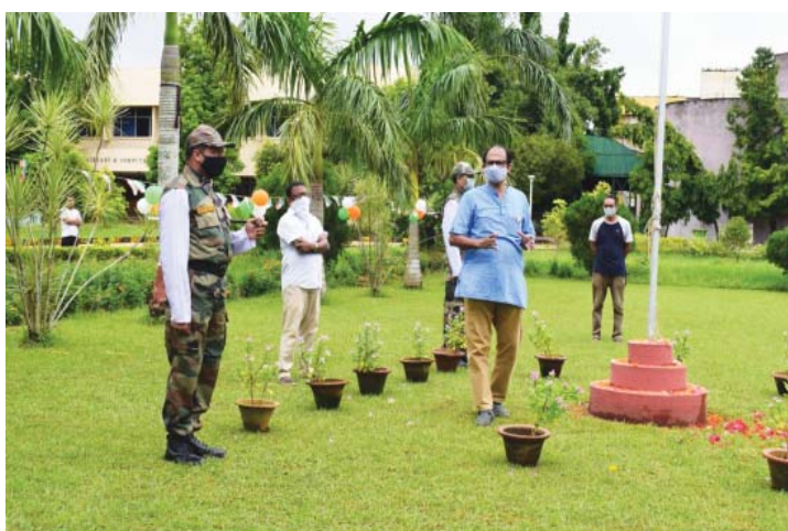
Celebration of Independence Day